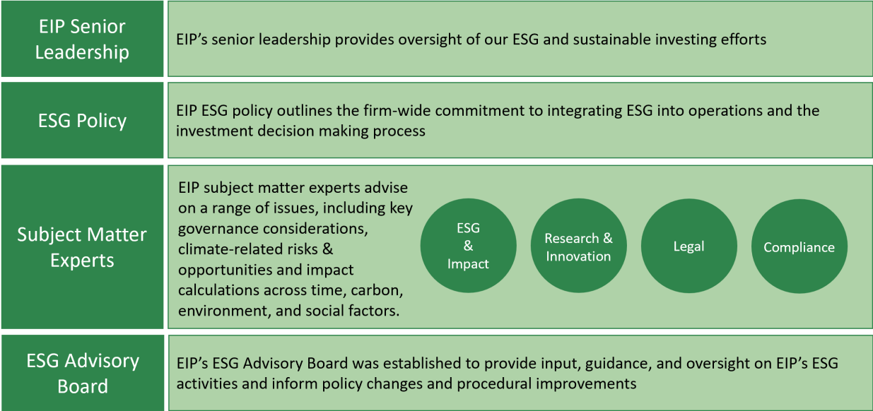
Figure 1: ESG Related Governance

The collaborative structure described below is how we incorporate climate-related risks and opportunities into the investment life cycle. The integration of climate change considerations into the investment process is described in more detail in the Risk Management section.